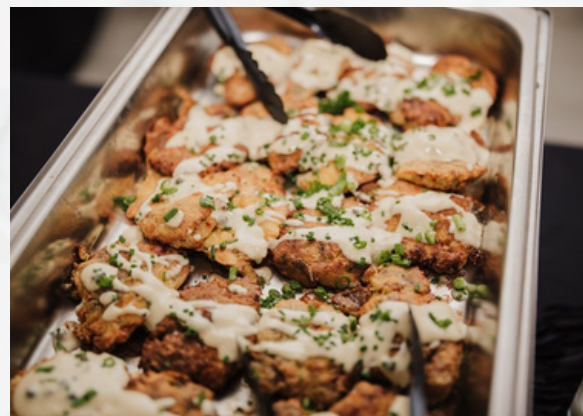
CHICKEN PICCATA WITH A LEMON CREAM