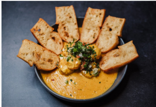
DIABLO SHRIMP WITH BAGUETTE BREAD AND TOMATO SALSA