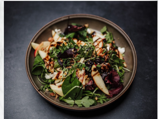
SPRING APPLE MIX SALAD