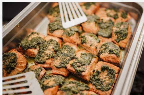
SEARED SALMON WITH PESTO SAUCE