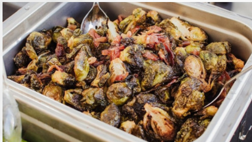
CANDY BACON BRUSSELS WITH APPLE BALSAMIC GLAZE

CHOICE OF 2 OPTIONS FROM THE FOLLOWING LIST