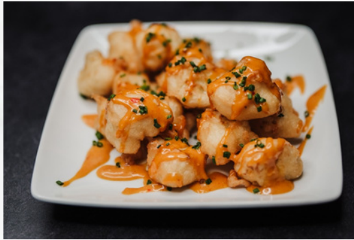
TEMPURA FRIED CAULIFLOWER WITH CHIPOTLE CREME